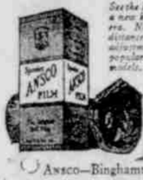
AnSCO—Binghamton, N. Y.

Supply the missing words in the above sentence and win a prize in the AnSCO Missing-Word Contest. Start today! Complete details in the Contest folder. Get one today at any store where AnSCO Speedex Film is sold. For better pictures load your camera with a roll of AnSCO Speedex Film—the film in the red box with the yellow band. There is a size to fit all roll-film cameras.