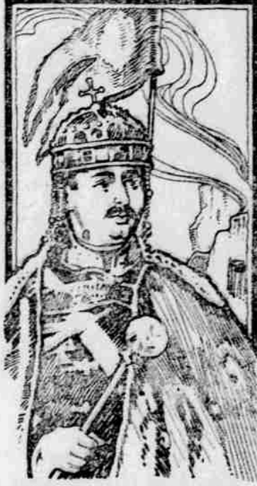
EMPEROR KARL OF AUSTRIA Vowed a church to our Lady, Queen of Peace, if the war should be ended shortly, two years ago today, April 18, 1917. Find an Austrian soldier. YESTERDAY'S ANSWER Upper right corner does between men