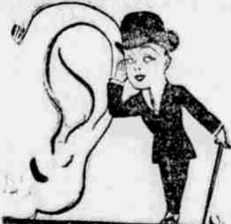
JUST A WORD.